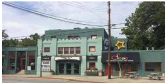
The Sharonville Cultural Arts Center completely updated their exterior with the addition of paint, lit displays, a custom awning, and shining star!