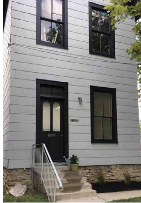
Kimble Mandolins in Downtown Sharonville went through an exterior renovation as a result of being awarded with an improvement grant.

Our current Electric Aggregation program, supplied by Dynegy, ends in December 2017. We will select our supplier for the next program (which begins in January 2018) in the coming month following a competitive bid. An update of the new supplier and price will be posted to the City's facebook and website at that time. All current program participants and those residents still receiving supply from Duke utility will receive the new program offer around the first week in October. Again, always look for the City of Sharonville logo on the envelope and letter to be sure it is the official aggregation program offer. If you are currently under an independent contract with a supplier, you will not receive the City's program offer.